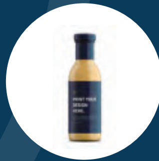
Middle & Neck