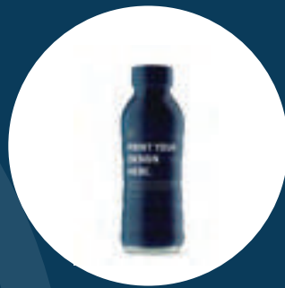
Full Body & Cap