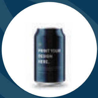
Can Shrink Sleeve